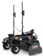
Laser Grading Box

All models come standard with a universal coupler that will work with numerous attachment manufacturers, meaning you can do more with a single machine to give your business even greater versatility. Consult your dealer for details.