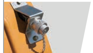
Front Electric/ Multi-Function (excl. SR160)