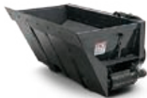
Side Discharge Bucket