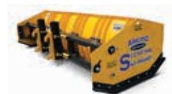
Arctic® Sectional Sno-Pusher™