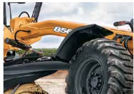
STANDARD FENDERS FRONT AND REAR