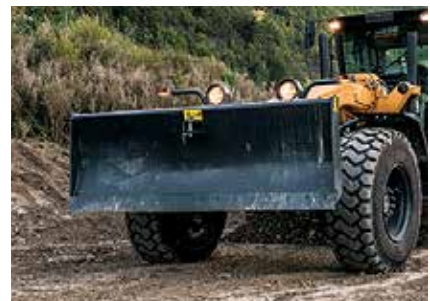
FRONT DOZER BLADE