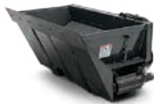
Side Discharge Bucket