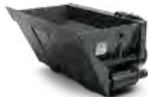
Side Discharge Bucket