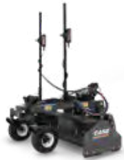
Laser Grading Box

All models come standard with a universal coupler that will work with numerous attachment manufacturers, meaning you can do more with a single machine to give your business even greater versatility. Consult your dealer for details.