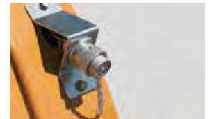
Front Electric/ Multi-Function