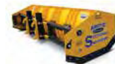
Arctic® Sectional Sno-Pusher™